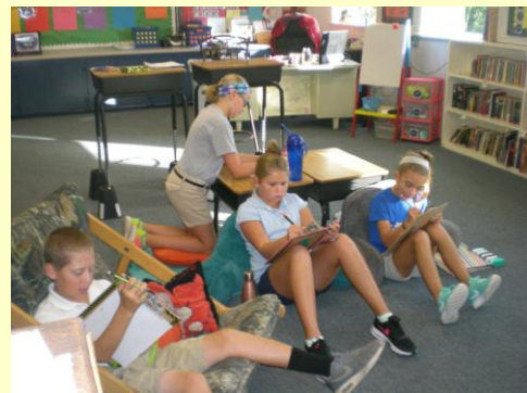
Taking their spelling assessment