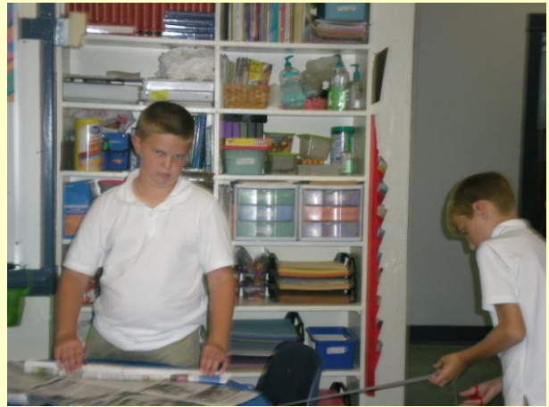
Making marble roller coasters